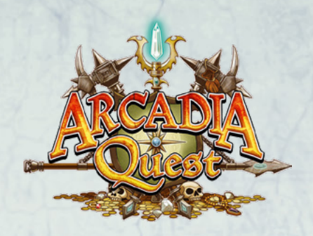
Version: 1.0 Last updated on February 5, 2015.