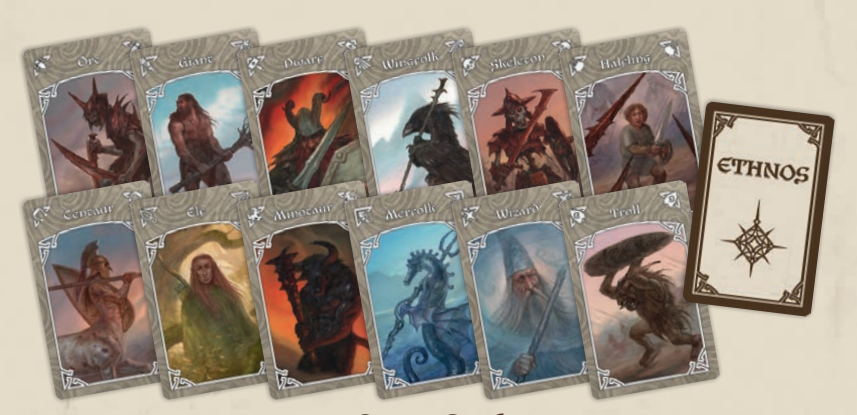
12 Setup Cards

depicting the land of Ethnos, divided into 6 Kingdoms