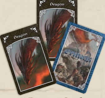
3 Dragon Cards