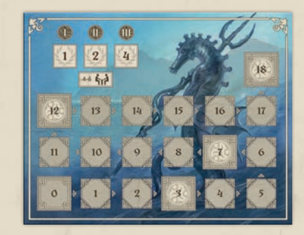
1 Double-Sided Merfolk Board