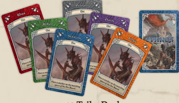
12 Tribe Decks —each with 12 cards, except the Halfling Tribe with 24 cards