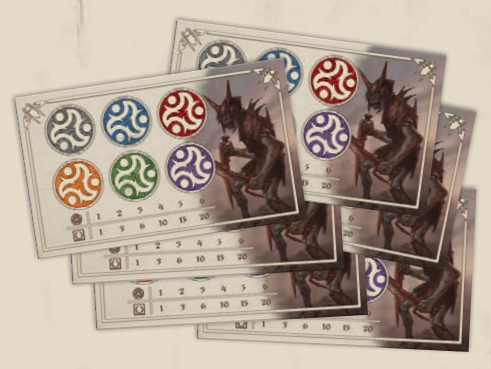
6 Orc Horde Boards