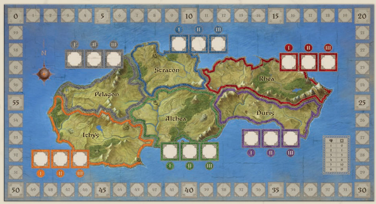
1 Main Game Board

depicting the land of Ethnos, divided into 6 Kingdoms